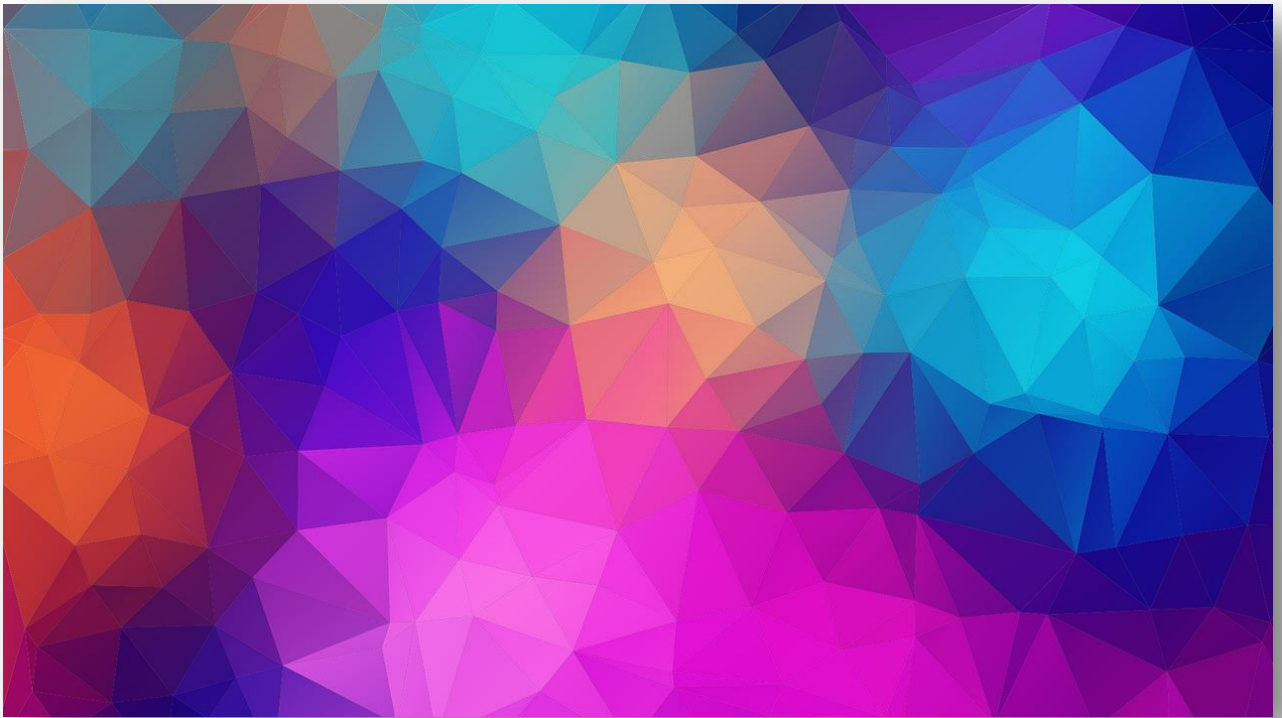
Imagen CCo Creative Commons